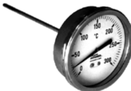
TB/45 ø 150 mm